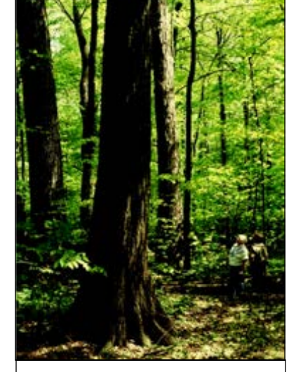
Johnson Woods State Nature Preserve

It was said that at the time of earliest settlement of Ohio, The Ohio Country was so heavily forested with huge trees, a squirrel could travel tree to tree, limb to limb, from the banks of the Ohio River to the shores of Lake Erie without ever touching the ground. It is hard to imagine how that early forested landscape must have appeared to the first settlers. Today, we only have historic accounts of this magnificent primeval forest for it was essentially timbered and converted to cropland