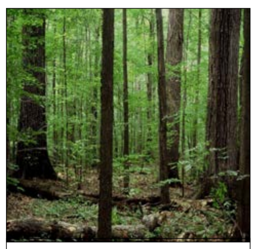
Johnson Woods State Nature Preserve

Johnson Woods State Nature Preserve is a wonderful place to visit in early spring, not only because of the beautiful array of spring wildflowers, but especially, because that is before the trees have totally leafed out so a visitor can get a much better view of the huge trees adorning this very special place; not unlike the view early settlers may have had of the primeval forests of Ohio. This preserve is located approximately 4 miles north of Orrville, Ohio on State