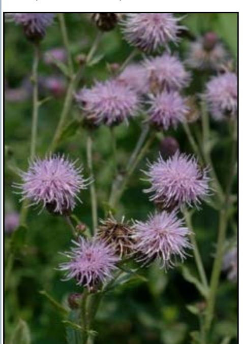
Canada Thistle in bloom.

Did you know that, in spite of its common name, Canada thistle ( Cirsium arvense ) is not native to Canada? Instead, it is native to southeastern Europe and the eastern Mediterranean region. It is a terribly invasive agricultural weed in Canada just as it is elsewhere in North America, northern and southern Africa, the Middle East, Japan, India, New Zealand, Australia, and South America. Canada thistle is thought to have been introduced to North America in the 1600s as a contaminant in crop seed or ship's ballast. Once established, the