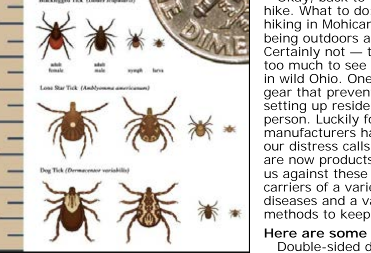
Ticks come in many sizes.

Okay, back to the unnerving hike. What to do: give up hiking in Mohican? Give up being outdoors altogether? Certainly not — there is just too much to see and discover in wild Ohio. One can look for gear that prevents ticks from setting up residence on one's person. Luckily for us, manufacturers have answered our distress calls, and there are now products that will arm us against these creepy crawly carriers of a varied array of diseases and a variety of methods to keep them at bay.