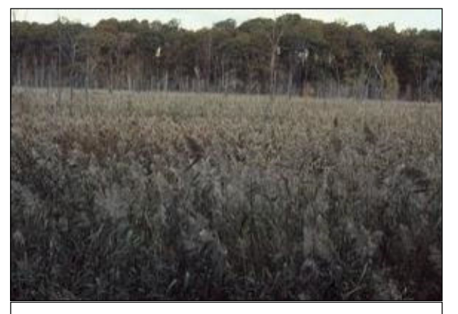
Phragmites run amok.

Phragmites is a tall, perennial wetland grass, reaching 5-10 feet in height or taller. It forms a dense network of rhizomes with deep roots, and vertical stalks arising from the rhizomes. Stiff hollow stalks support 1-2-inch wide leaves. It flowers in late July through August with bushy, gray-brown panicles. Both native and non-native subspecies occur in Ohio, with the native one being much rarer and harder to identify. The native subspecies usually is not aggressive, has smooth, shiny, somewhat purple stems, and short ligules. A few sites which are known to harbor the native