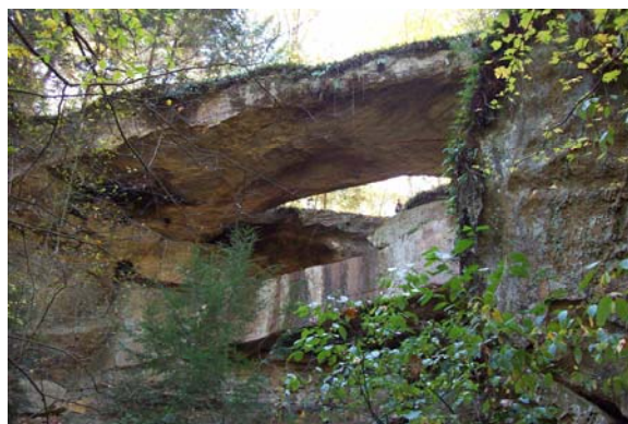
Ladd Natural Bridge State Nature Preserve, Washington County

The arches described here are publicly accessible. Ladd, Raven Rock and Saltpetre Cave require a free access permit which can be obtained from the Division of Natural Areas & Preserves ( http://naturepreserves.ohiodnr.gov/permits ). Detailed information on 83 Ohio Natural Arches is available in Rainbows of Rock, Tables of Stone: The Natural Arches and Pillars of Ohio , available from McDonald & Woodward Publishing ( mwpubco.com ). The Ohio Geological Survey ( www.OhioGeology.com ) offers a free brochure on Ohio's natural arches which lists those that are publicly accessible.