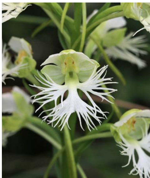
Eastern prairie fringed orchid