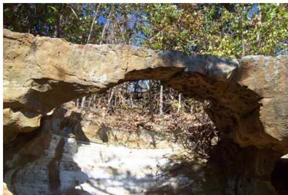
Raven Rock Arch, Scioto County

Miller Nature Sanctuary in Highland County protects a short section of the northern wall of Rocky Fork Gorge. Included within its boundaries are two readily-visible natural arches. Miller Natural Bridge, like most of Ohio's natural bridges, formed when an enlarging vertical crevice met a deepening alcove. The Bridge Trail offers views of it from both above and below. Miller Arch, readily visible from the Falls Trail, evidently resulted when weathering removed fractured dolomite from a buttress of bedrock extending from the cliff.