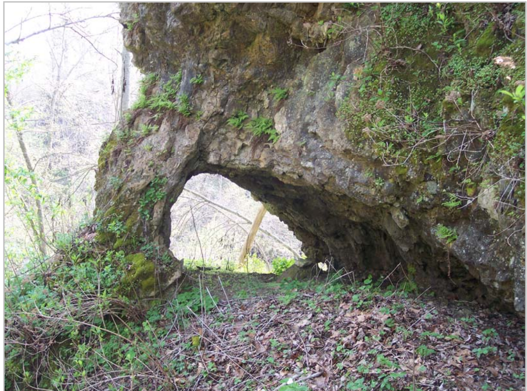
Miller Sanctuary State Nature Preserve.

The Ohio Department of Natural Resources Division of Natural Areas and Preserves is justly celebrated for protecting rare plants and threatened ecosystems. Less well known is the Division's legislated mandate to protect Ohio's outstanding geological features, which is why places like Clifton Gorge and Conkles Hollow are part of the state nature preserve system. One geological feature that most people might not even be aware exists in the state is the natural arch (also commonly called "natural bridge"). Ohio has more than 80 natural arches, and several of them are within protected nature preserves.