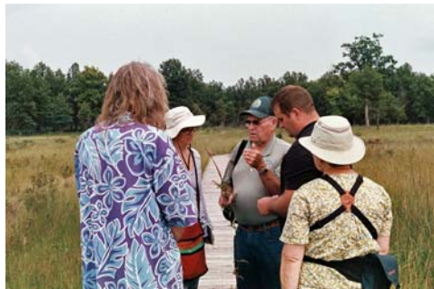
Field trip to Irwin Prairie at ONAPA Annual Meeting.