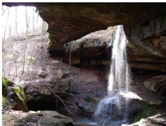
Rockbridge, Hocking County

Cave, the alcove behind it reaches an impressive 124 feet into the hill. It is just one of several alcoves or "recess caves" found in this small preserve, two of which have joined to form Surprise Arch which takes a bit of sleuthing to see.