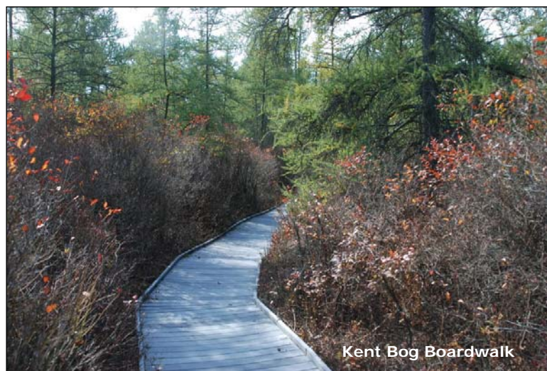
Kent Bog Boardwalk

Although it was many years ago, I vividly remember driving the back roads in and around Portage County searching for signs of yet undiscovered tamarack bogs, good candidates for sites hosting a variety of rare bog plants thus worthy of becoming state nature preserves. As the Assistant Chief of the newly created Division of Natural Areas & Preserves, I was always on the lookout for natural areas of statewide ecological significance. It was late October, after the leaves of deciduous hardwood trees had fallen. This was the perfect time of year to search for the illusive tamarack ( Larix laricina ), a tree more at home to the boreal forests of