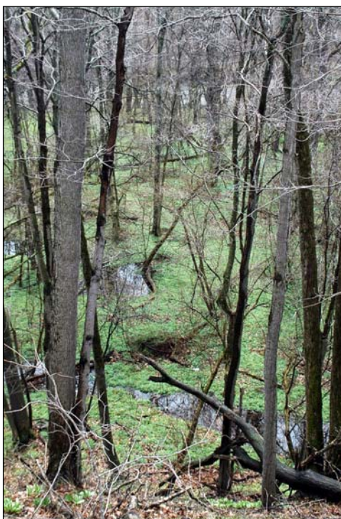
Lesser celandine in the floodplain at Olsen Preserve.

eradication of lesser celandine. It may be critical to utilize an aquatic herbicide since lesser celandine is often found in wetland and riparian habitats. An aquatic glyphosate, utilized at a 1% -1.5% rate is an effective systemic herbicide that is readily available. A non-ionic surfactant should also be added to the chemical mix to improve penetration through lesser celandine's waxy leaves. It is important to note that glyphosate is a non-selective herbicide, therefore it will kill non-target species that receive any overspray. Mechanical digging can be an effective option for small populations outside of riparian corridors. It is not recommended in areas where flooding is likely because the soil disturbance will increase the likelihood of remaining tubers and bulbils floating into areas that are not infested, thus increasing spread. It is also difficult to dig without leaving tubers and bulbils in the ground.