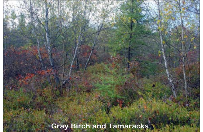
Gray Birch and Tamaracks