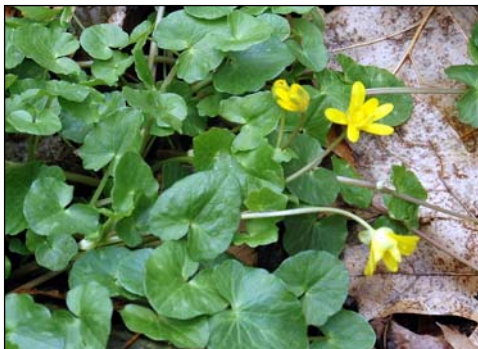
Lesser celandine.

Land managers must find the best ways to use limited resources to combat the greatest threats to biological diversity and ecosystem function. Often it seems that the most limited resource is the time and funding needed to measure the effects of invasive plant management strategies. Systemic chemical herbicides are typically required for the successful control and