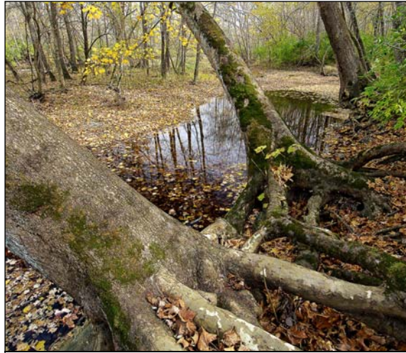
Sycamores at Caesar Creek State Nature Preserve

This site was once covered by vast tropical seas and later by giant glaciers. Ordovician fossils ranging from 450 to 500 million years old are found in the limestone forming the crest of the Cincinnati Arch. The activities will feature the fossil areas above the gorge, the state park's Visitor Center, the gorge