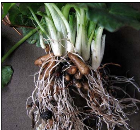
Lesser celandine roots and tubers.